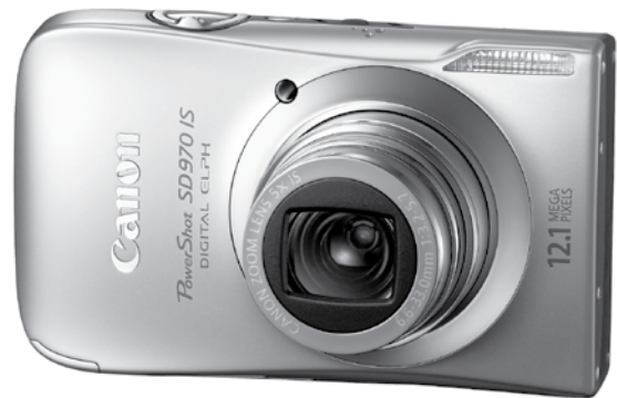
Tiny cameras can display pictures immediately.

Photography is now accessible to the casual user. We can snap a picture, immediately see it on a digital display, and then upload it to our computer. From there we can touch it up and print it—all without access to a darkroom full of chemicals. Of course, you still need to have an eye for photography to get a good picture.