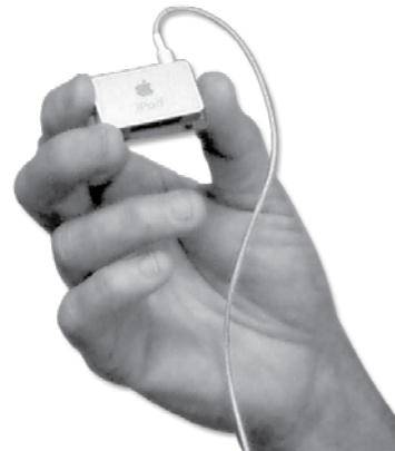
iPod shuffle music player.

Tiny devices like the one shown here can hold ALL of your music library.