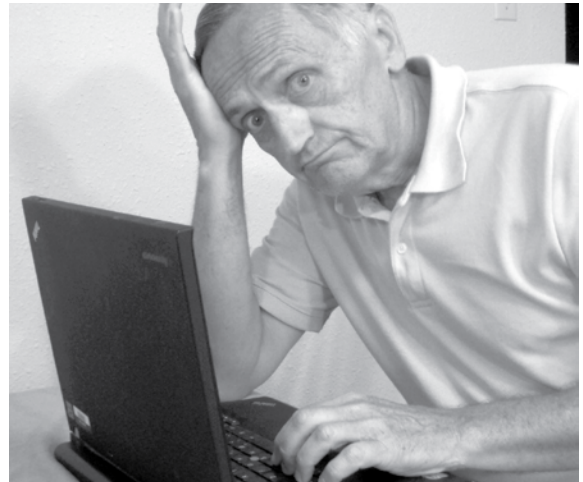
More seniors are using computers.

Home computers were developed in the late 1970’s, gained widespread popularity in the 1980’s, and have since found their way into over 75% of American homes. We use these for everything: word processing, playing games, communication (email and the Internet), shopping, business management, and education—to name a few.